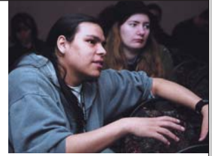
Youth Outreach delegates