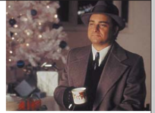
Seven Times Lucky