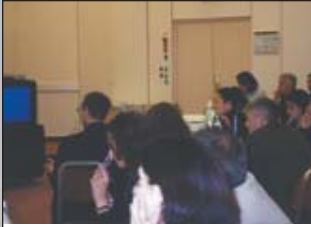
NSI Global Marketing participants at KickStart@MIPTV