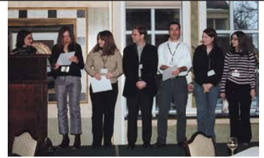
2004 NSI ZeD Drama Prize winners introduced at NSI FilmExchange