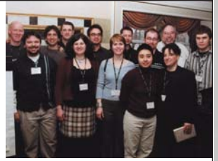
2003–2004 NSI Features First participants at NSI FilmExchange