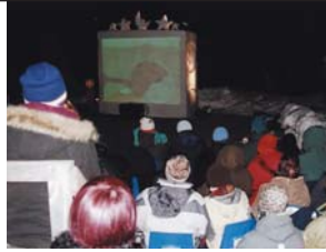
NFB Animation on SnowScreen