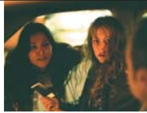
On the Corner