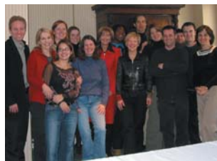
NSI Totally Television participants