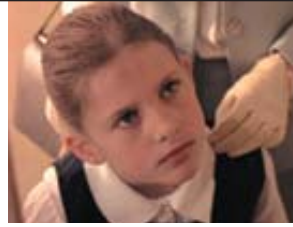
My Original Sin