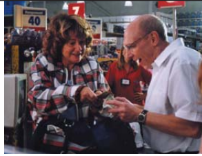
Redeemable in Merchandise